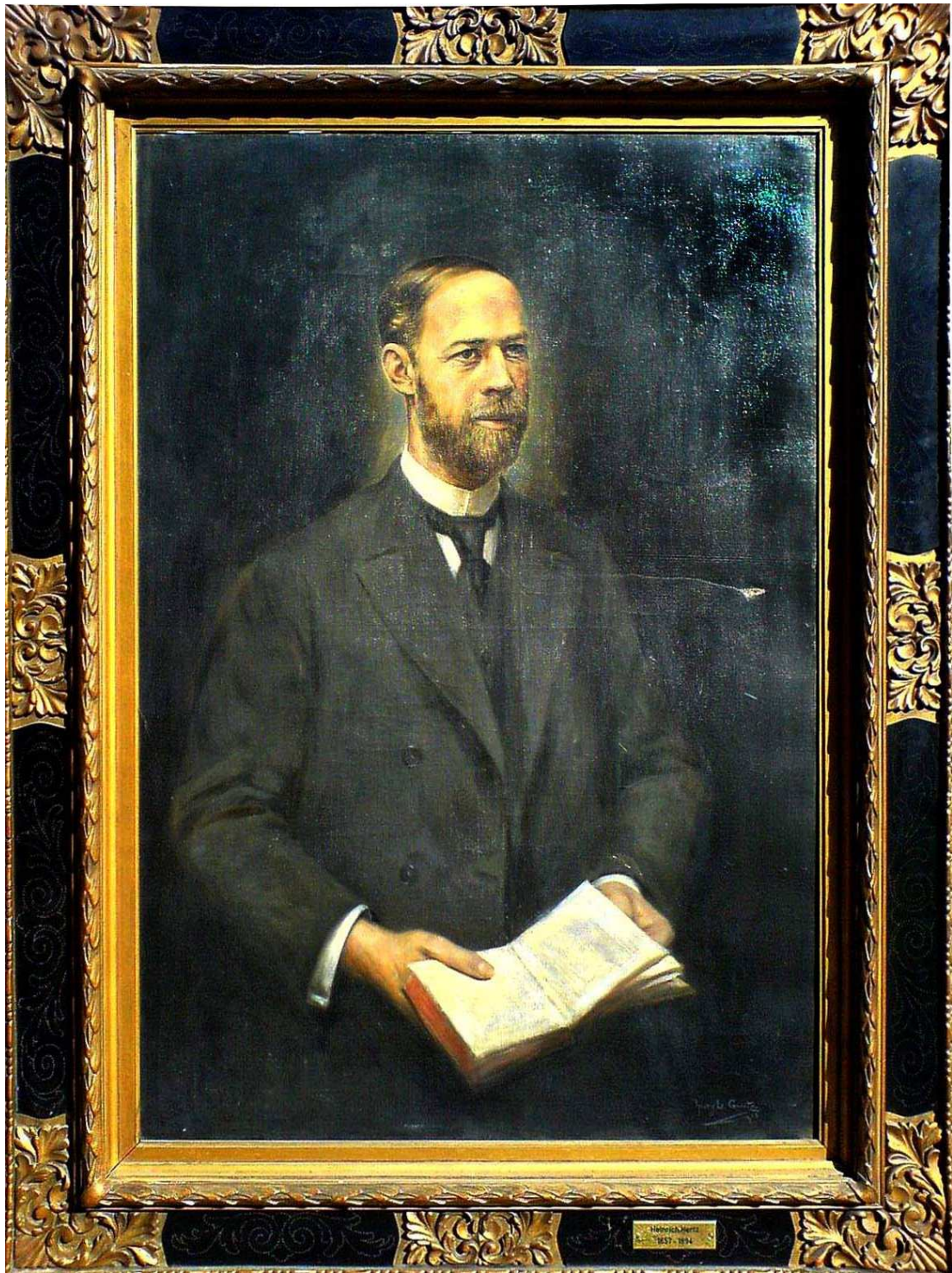
Figure 0.1: Portrait of Heinrich Hertz (1857–1894) Painting in the Department of Physics, Hamburg University